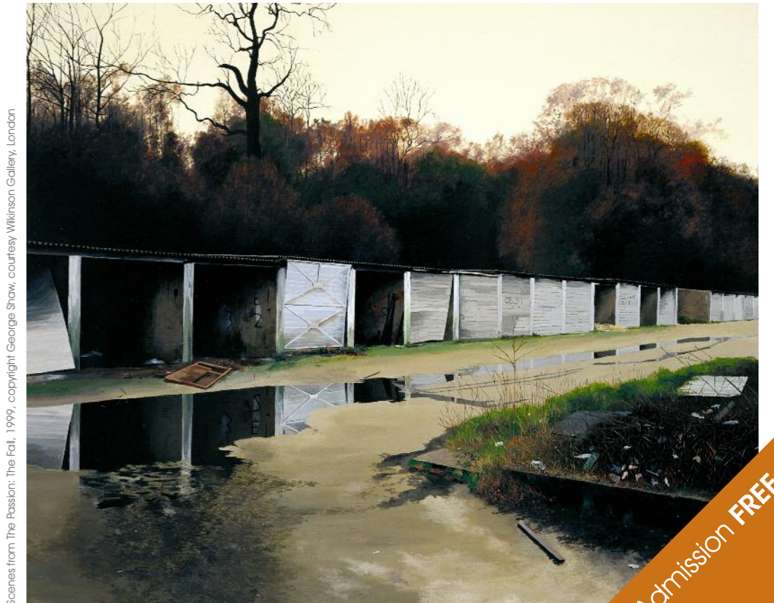
Scenes from The Passion: The Fall, 1999, copyright George Shaw, courtesy Wilkinson Gallery, London