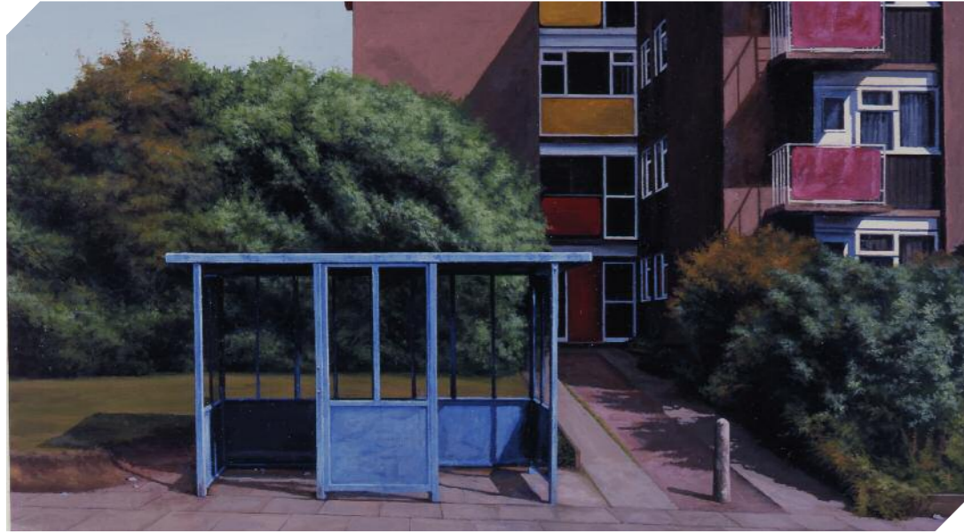
Scenes from The Passion: Bus Stop at the Top, 2003, copyright George Shaw, courtesy Wilkinson Gallery, London

Enamel Urban Landscapes £15 + £5 materials Monday 20 February 10.00am – 4.00pm