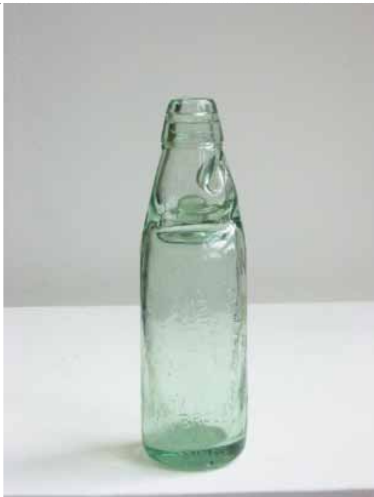
Victorian soft drink bottle

This is a Victorian drinking bottle and would have possibly held lemonade. There was a glass ball at the top to stop the fizz from disappearing.