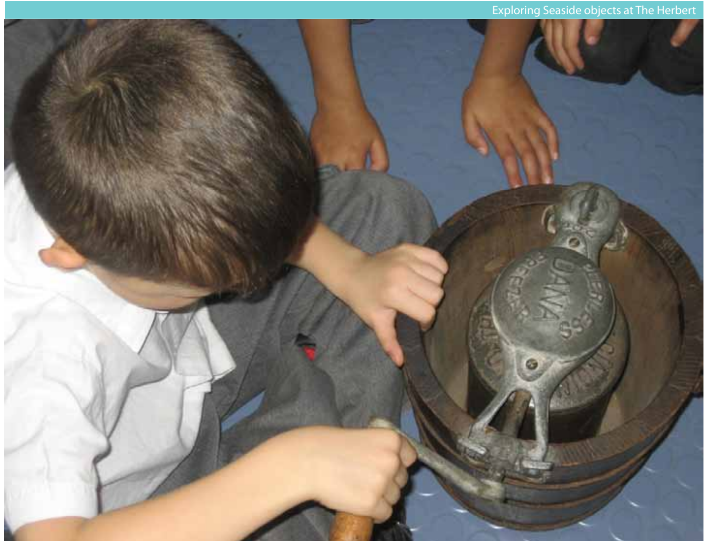
Exploring Seaside objects at The Herbert