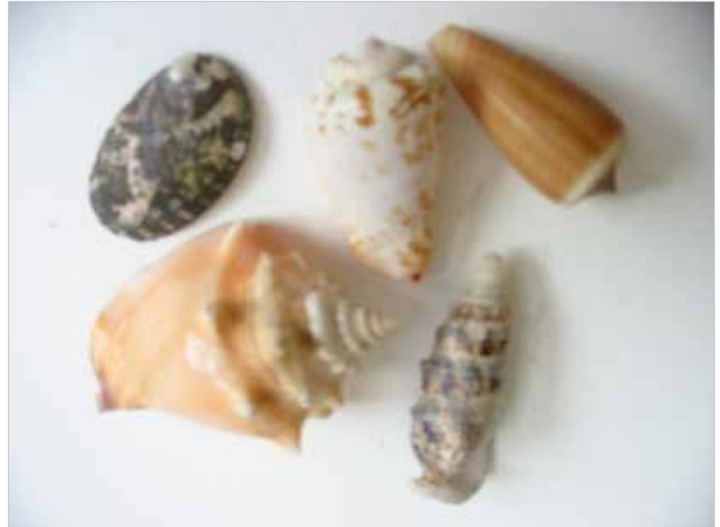
Selection of shells

This is a small collection of shells from the seaside.