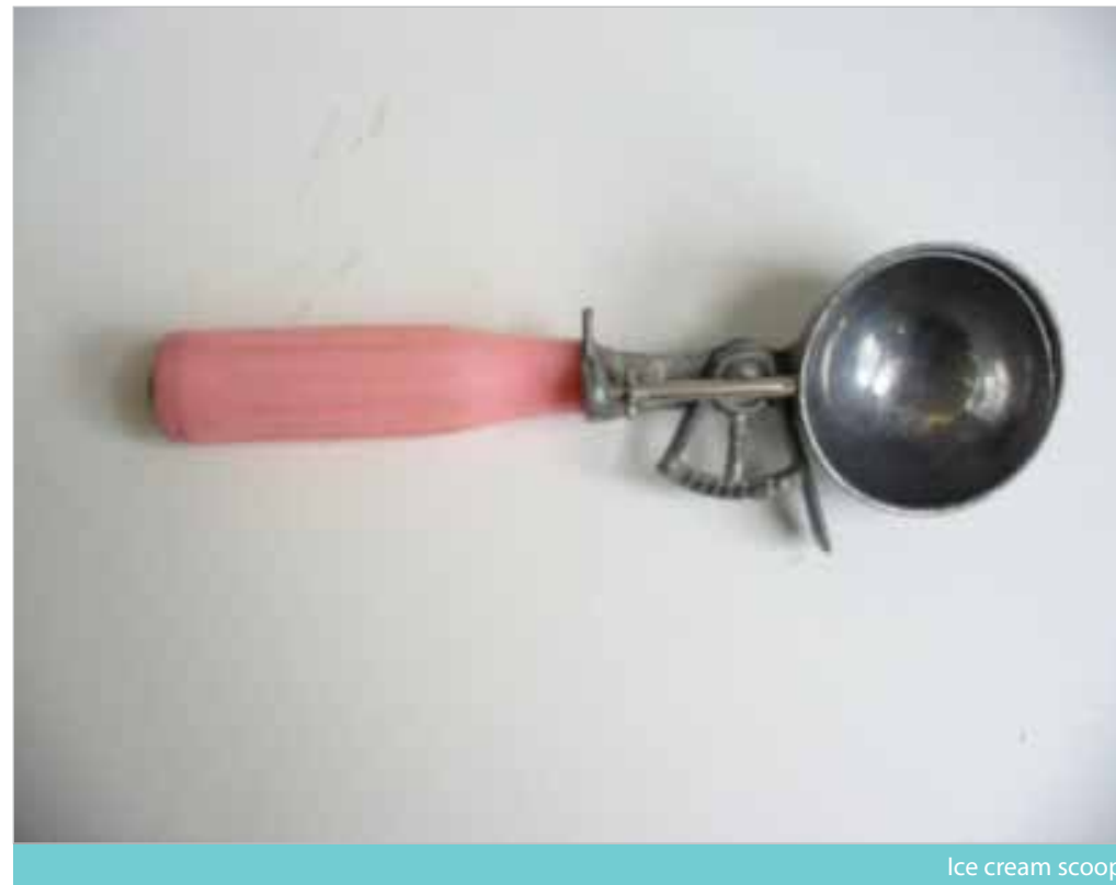
Ice cream scoop

This can be handled during the Active Learning Session.