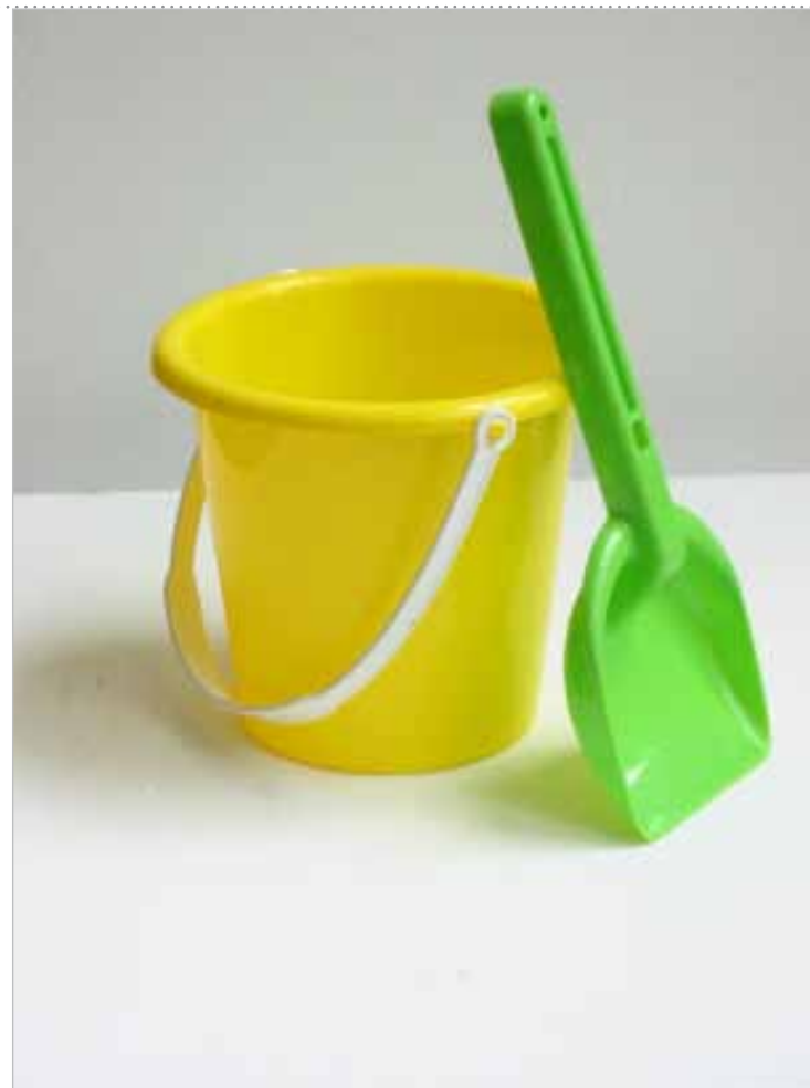
Modern bucket and spade

This can be handled during the Active Learning Session.