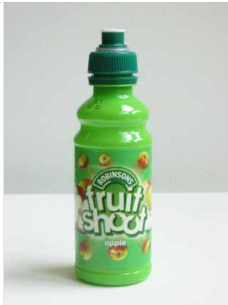
Modern soft drink bottle

This can be handled during the Active Learning Session.