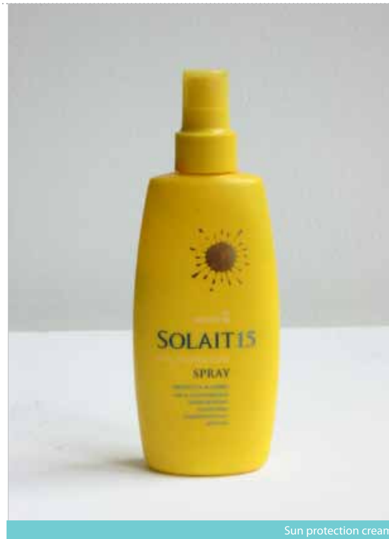
Sun protection cream

This can be handled during the Active Learning Session.