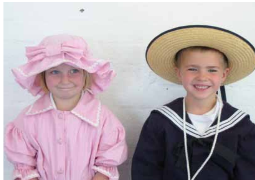
Dressing up in Victorian seaside costume at the Herbert