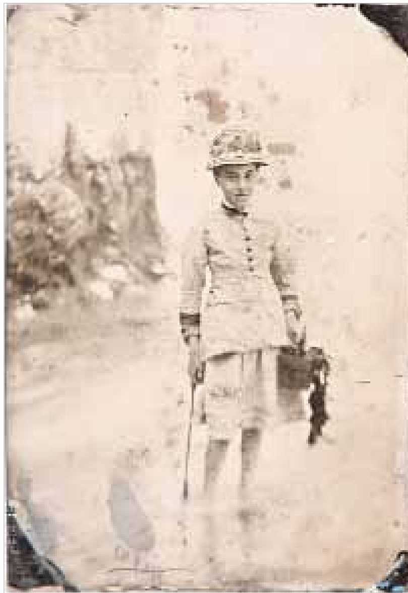
Victorian girl at seaside