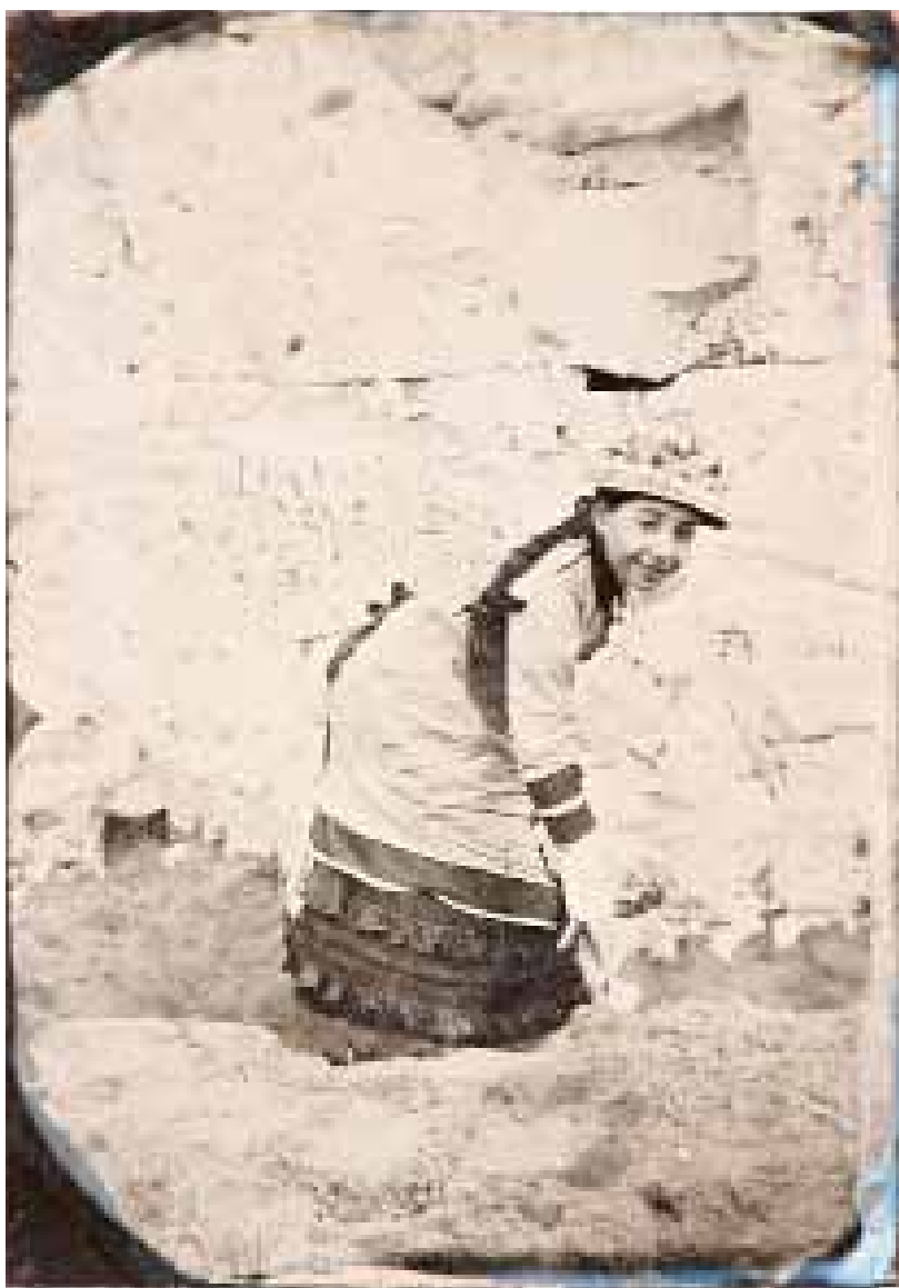
Victorian girl at seaside