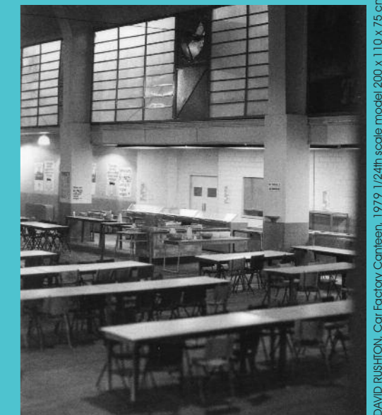
DAVID RUSHTON, Car Factory Canteen, 1979. 1/24th scale model. 200 x 110 x 75 cm. Interior detail.

To book your place, please call 02476 834774.