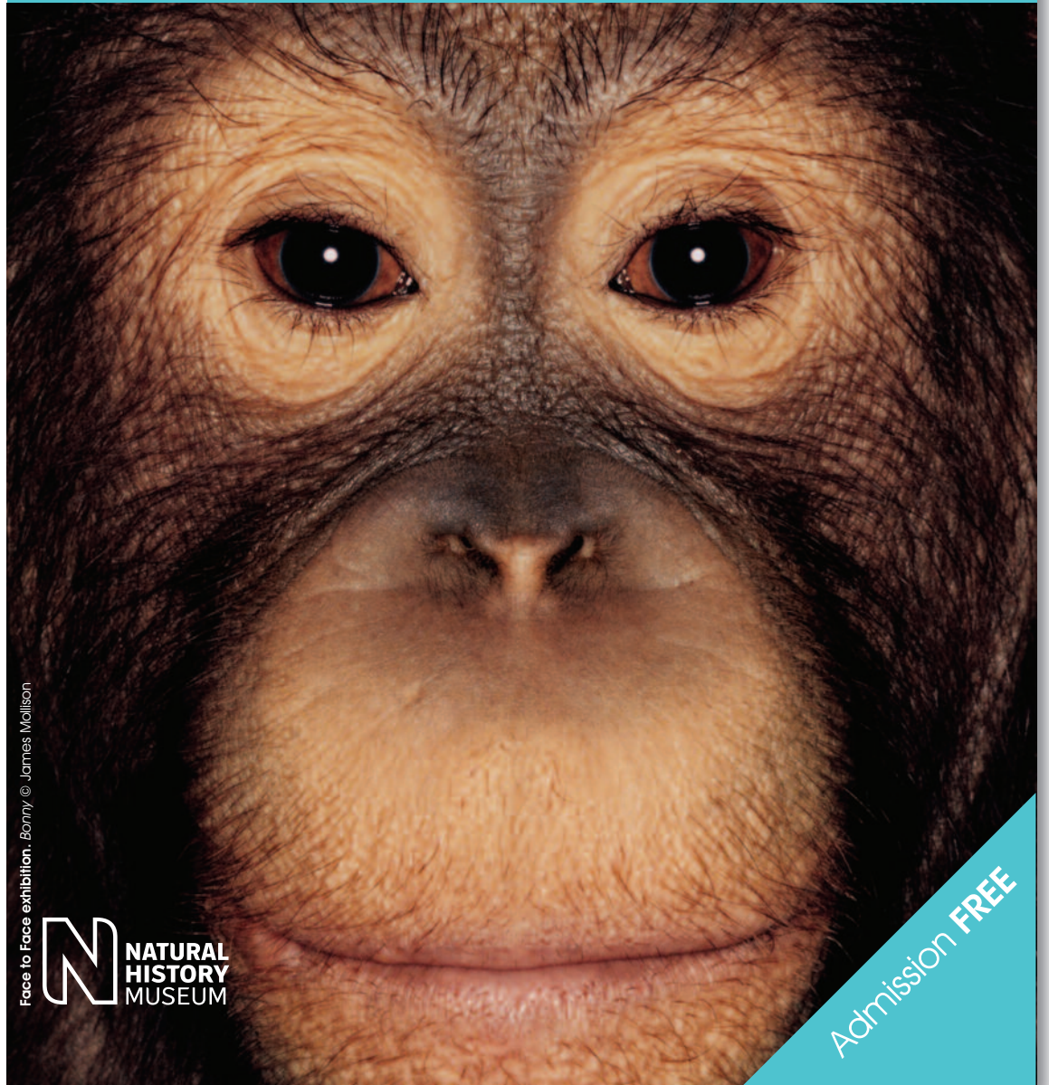
Face to Face exhibition. Borany

FACE TO FACE 31 July – 26 September Upstairs in Galleries 1, 2 & 3