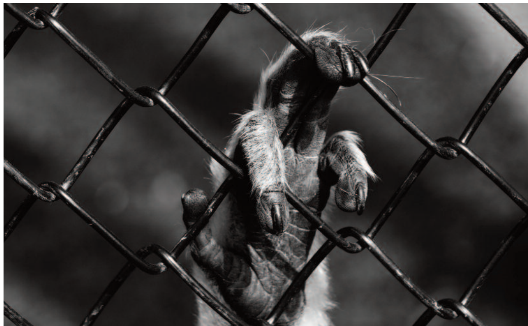
Entrapment No1 | © Katie Boyce

Roots also includes a sensory display, offering a closer look into the theory that humans and animals are closely related, looking at their emotions, intelligence and use of tools.