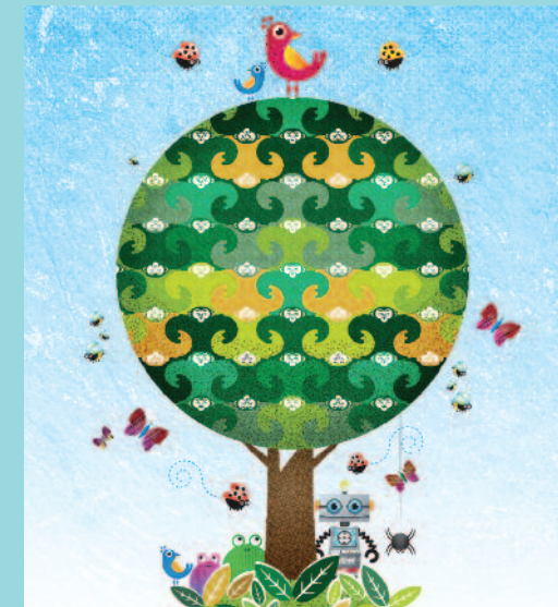
In the Big Treetop: Nigel Hopkins, Blind Mice Design