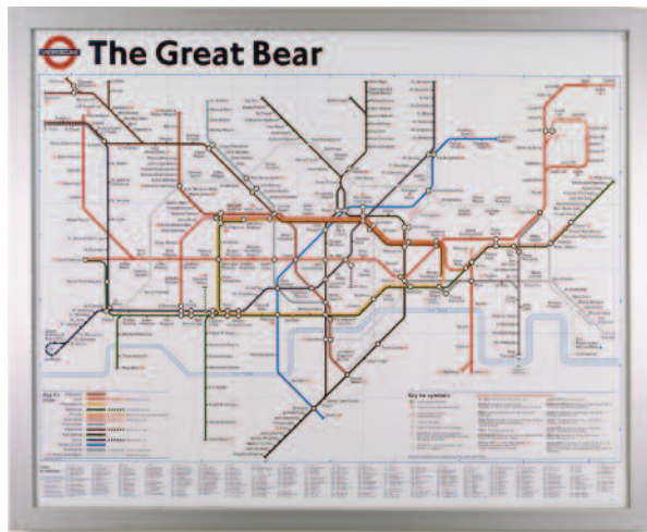
Simon Patterson The Great Bear, 1992. 4-colour lithograph in glass and aluminium frame, edition of 50/109.2, x 134.6 cm, 45.02 x 53.03 inches. Courtesy of Haunch of Venison. Copyright Simon Patterson and Transport of London.

There will be a display work of specially produced in response to some of the pieces in the exhibition by both a group of young people and an art group from Peace House in Coventry.