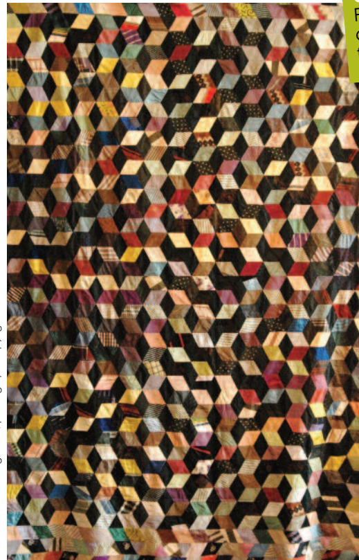
Victorian silk tumbling block