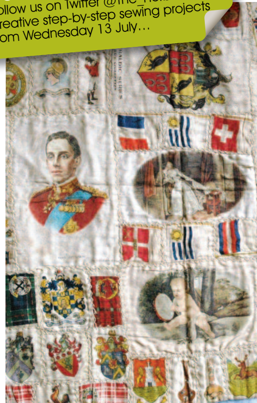
1920s cigarette silk cushion